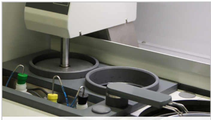
CLEANING AND ULTRASONIC STATION