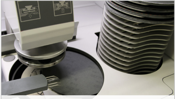
GRINDING AND POLISHING STATION WITH FOIL STACK